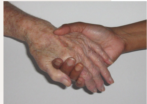
"Sharing the Care"